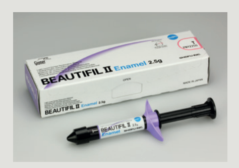
Syringe with 2.5 g each