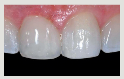
Clinical case, before and after, with BEAUTIFIL II Enamel