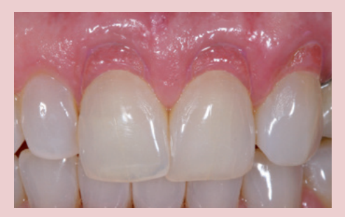
Clinical case, before and after, with BEAUTIFIL II Gingiva in Light Pink