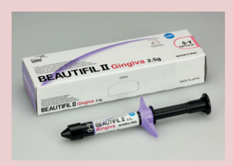
Syringe with 2.5 g each